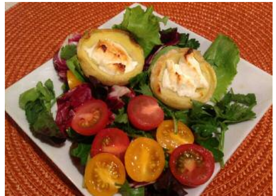
Salad with goat cheese-stuffed artichoke bottoms